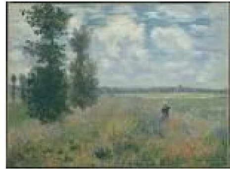
Poppy fields near Argenteuil