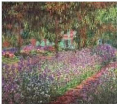
The Artist's Garden at Giverny