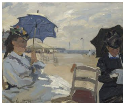
The Beach at Trouville