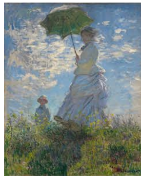
Woman with the parasol