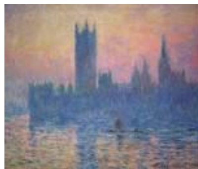
The Houses of Parliament