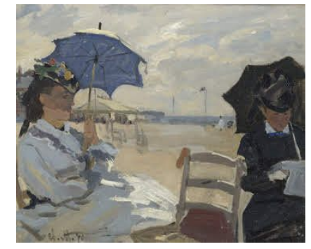
The Beach at Trouville