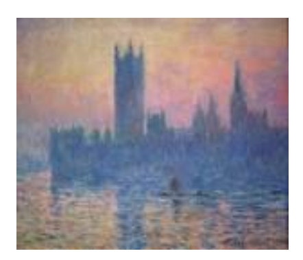
The Houses of Parliament