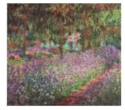
The Artist's Garden at Givenchy