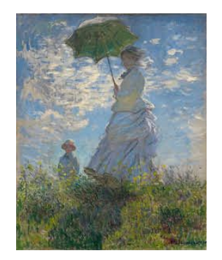
Woman with the parasol